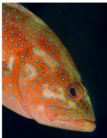
Coral Grouper (Martin Edge)