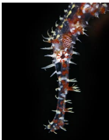
Ornate Ghost Pipefish (Martin Edge)