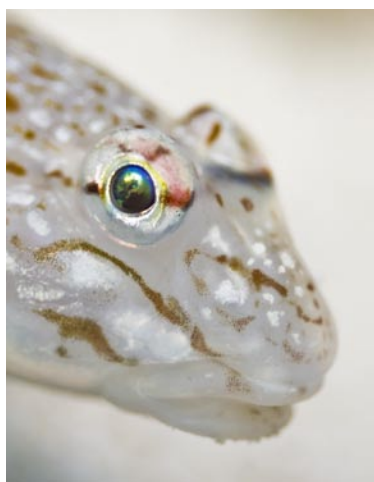
Tangaroa Shrimpgoby