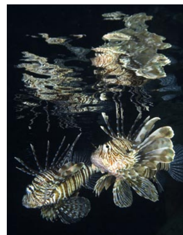
Common Lionfish