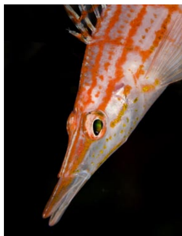
Long-nosed Hawkfish (Martin Edge)