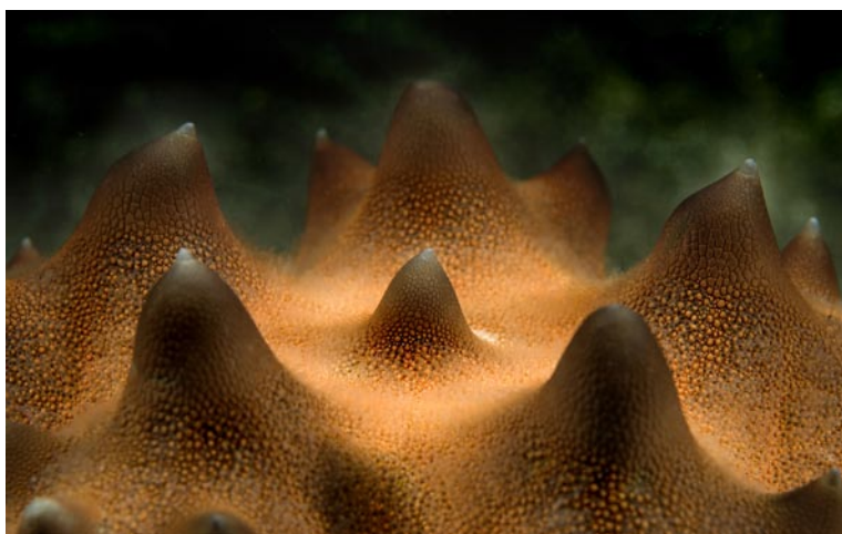
Horned Starfish (Martin Edge)